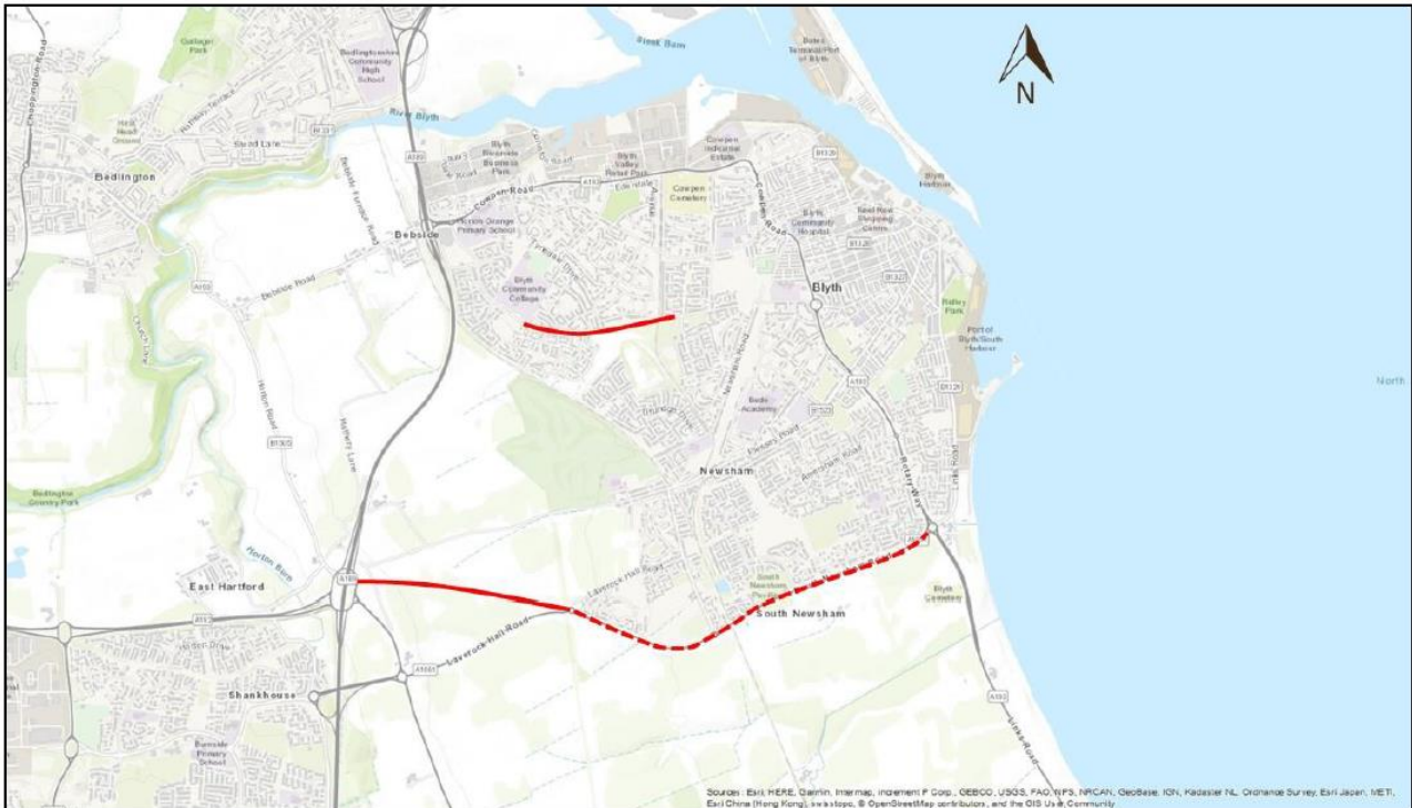
Map 2 – Preferred Route Alignment – Route 5